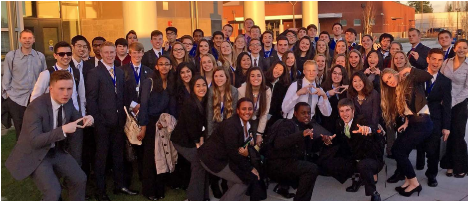
Shorewood DECA students at their Area 2 Conference at the Lynnwood Convention Center on January 13 th . 37 Shorewood students are advancing to State, which will be held in Bellevue in March.

Buy Now! Senior Spree Price Increase February 14 Spree Tickets are available at the early bird price of $150 through February 13 th . A $50 non-refundable deposit will hold your spot and your price with the balance due May 8 th , 2015. Ticket prices will go up to $175; buy now and save $25! Scholarships are available: contact your counselor for more information.