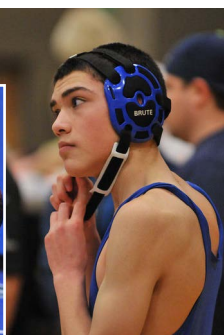
Shoreline Invitational Recap on the Shoreline Area News.