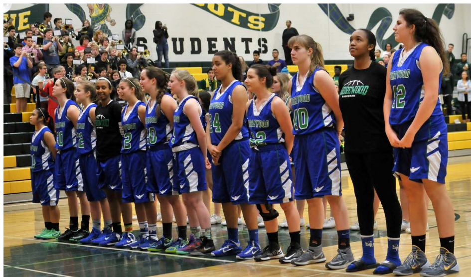
Girls Basketball ready to take on the Shorecrest team.

Speak Up Legislators will hear a lot about minimum wage, paid sick leave, and neighborhood control over development. They need to hear about education too. It is not too late to send a letter to our legislators in Olympia , letting them know what you think. You can also leave a note in the PTA Letters box in the SW office and we will send them together.