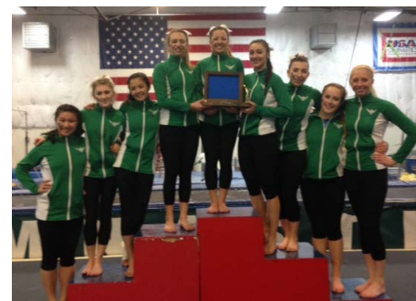
Shorewood Gymnasts are the new District Champions!