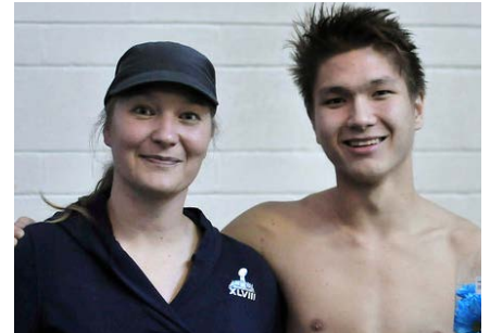
Boys Swimming recognized team Seniors on January 29 th.