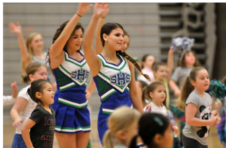
January 24 th Cheer Clinic for local kids.

A resource for all Shorewood families, run by PTSA volunteers in cooperation with the Shorewood Administration, Counseling Department, and Career Center. We support families as they help their students figure out life After Shorewood, whether the goals involve college, vocational school, or a career.