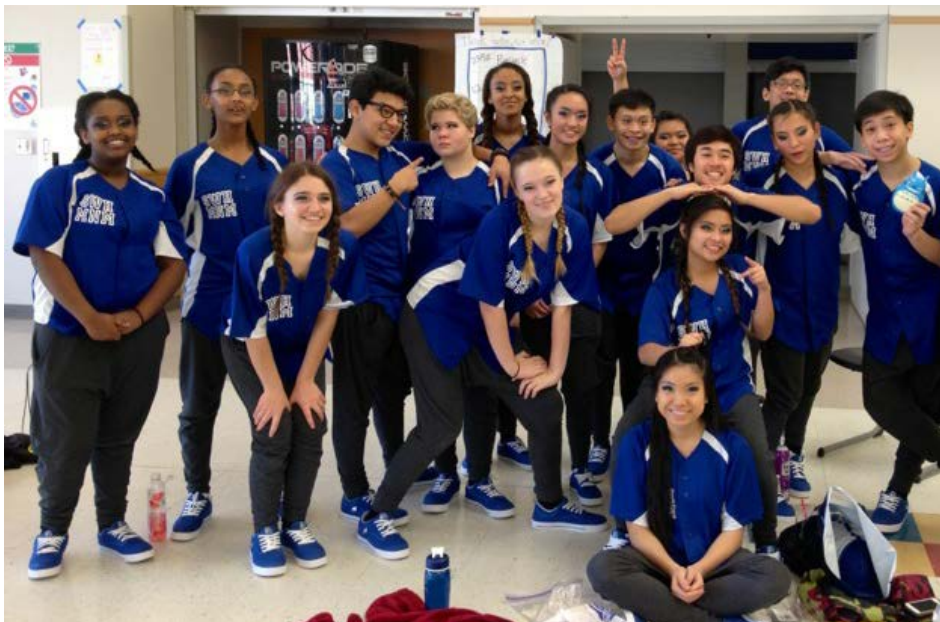
Hip Hop Team excited for State competition!