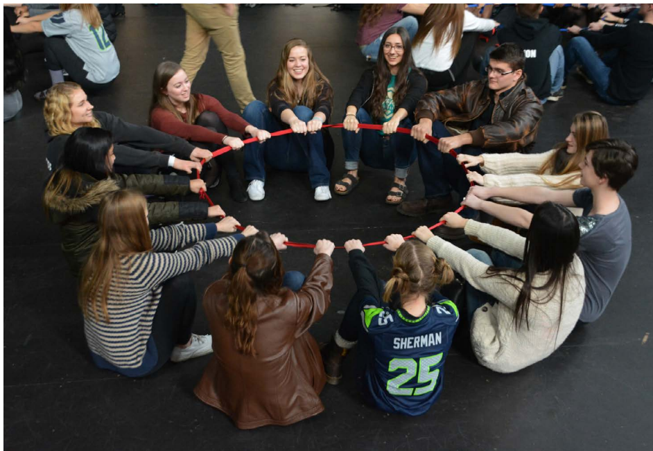
Shorewood students in a leadership workshop held after the January 9 th Martin Luther King, Jr. Assembly that kicked off a special week. See page 8 for more.