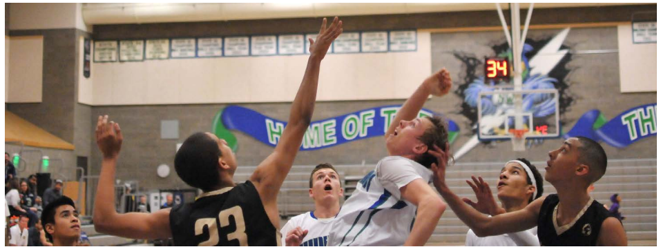
Basketball vs. Lynnwood January 30 th.