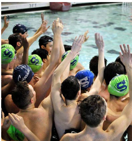
Swim Meet vs. Shorecrest.

Thursday, March 5: Drugs in our Community