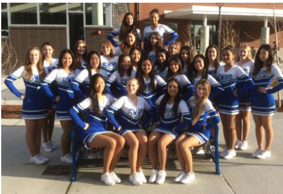
Shorewood Drill will compete at State March 26-28 in Yakima.