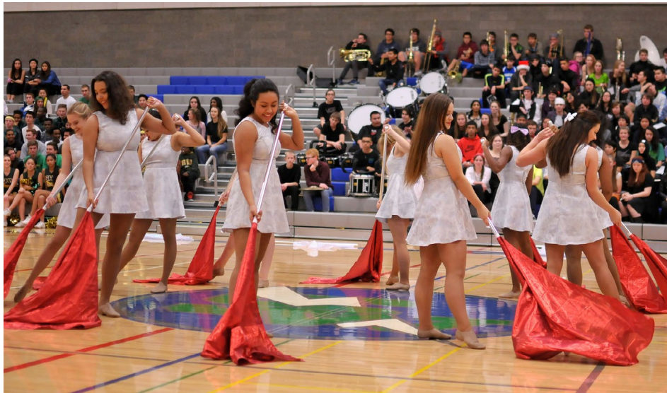
Flag Team December 18 th , during basketball games vs. Shorecrest.