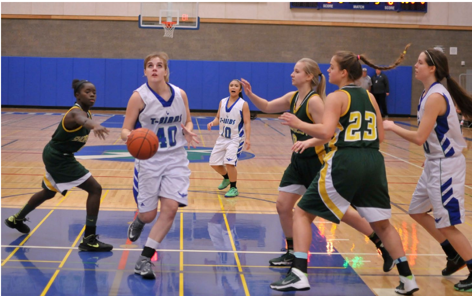
Girls Basketball vs. Shorecrest December 17 th .