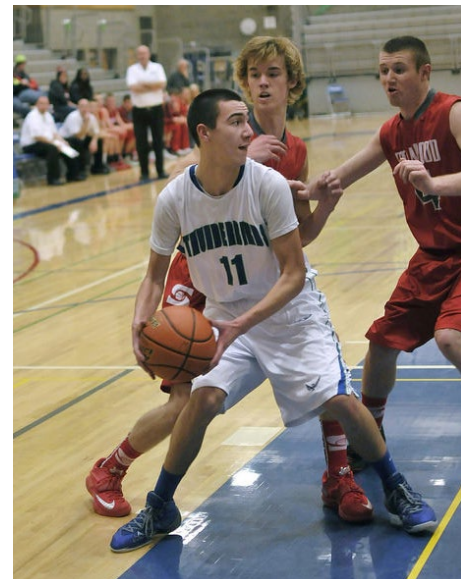
Top: Girls' Basketball vs. Lake Stevens December 5 th . Bottom: Boys' Basketball vs. Stanwood December 2 nd .