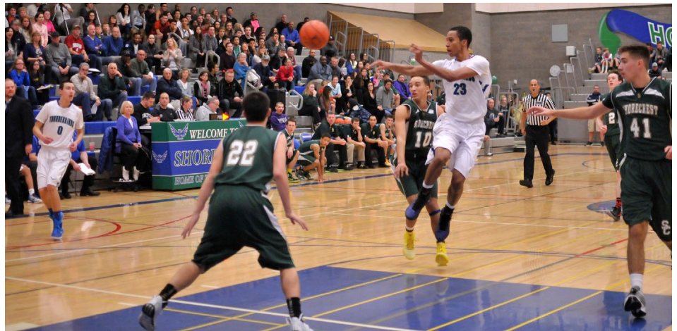
Boys Basketball vs. Shorecrest December 18 th.

College admissions is a big business, and lots of companies try to get $$ from vulnerable families. The scams provide minimal—or completely nonexistent—services that are unnecessary or available elsewhere for free. There is also a study materials scam via phone calls to many junior families, so please be aware and be ready to say no to phone offers. You may receive letters in the mail; be very skeptical of any offers.