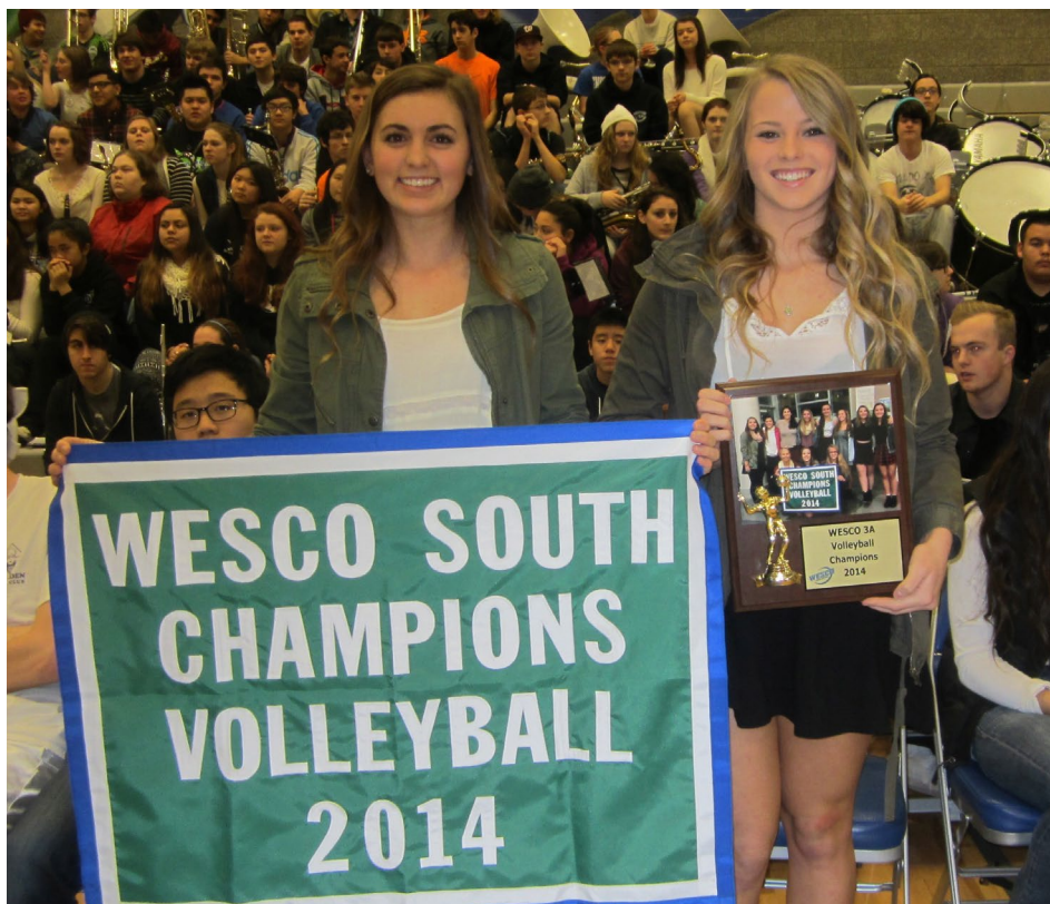
Above and lower right: on December 18 th, the Volleyball and Tennis Captains presented the League Championship Banners during the Sports Assembly.