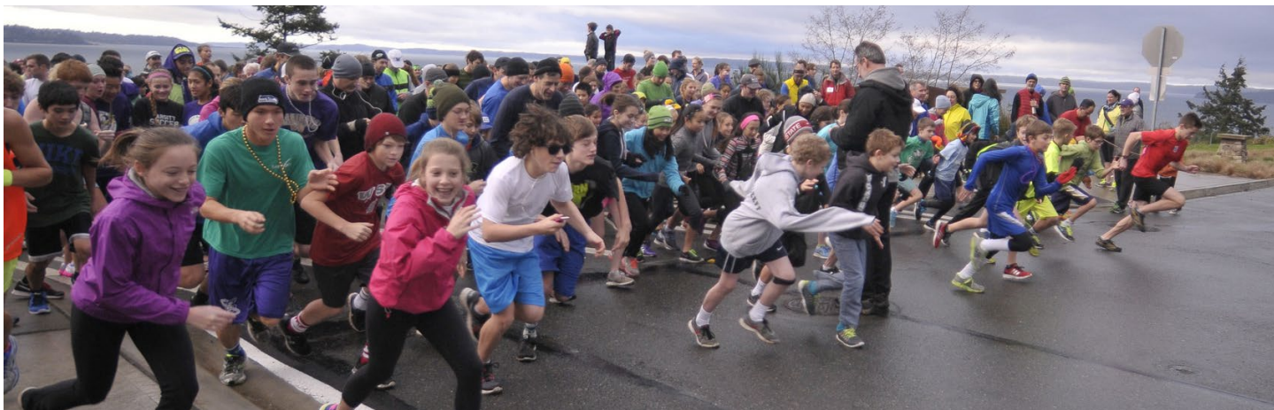
On Thanksgiving Day 2014, the Richmond Beach Turkey Day Fun Run attracted many current, former, and future Shorewood students, parents, and friends.