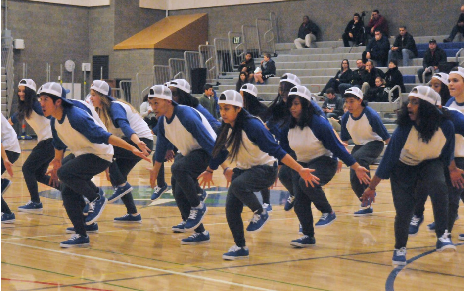
Shorewood Hip Hop performs December 2 nd at halftime during basketball vs. Stanwood.