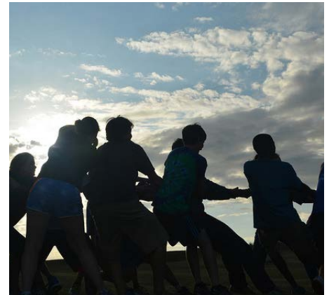
The cross country team playing a friendly game of tug-of-war on its Labor Day retreat at Camp Casey.