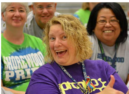
SW staff is ready!

The new schedule includes SAS or Student Academic Support every day for 30 minutes at 9:40 AM after the first long period. SAS is a home base period designed to 1) support student learning and 2) help students connect to school. SAS may be listed on schedules as Period 10. Teacher-directed activities may include: intervention, 1:1 or small group work; pre-teaching; re-teaching; work completion; or make-up work. The goal is that every student will be well-known by at least one adult through small groups, academic monitoring, and school-wide activities.