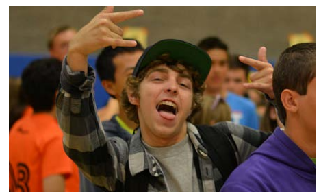
New year, new freshman faces at Shorewood.