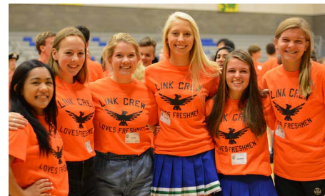
LINK crew leaders.

To volunteer—for anything for SW PTSA—send an email to swptsa@gmail.com . In the email, include your name and the year your youngest child at Shorewood will graduate. You will receive occasional emails asking for volunteers and you can respond if and as you wish.