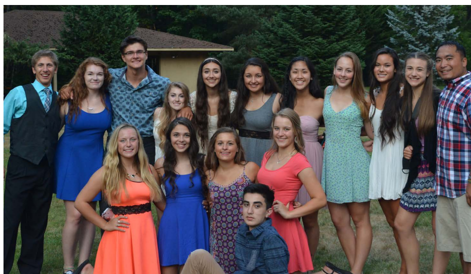
In August, Shorewood leadership students spent a week at Mt. Adams Leadership Camp. They are ready for a great school year.