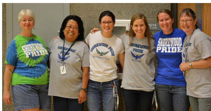
The LINK crew and Shorewood staff offered a warm welcome to the new freshman class at the end of August.