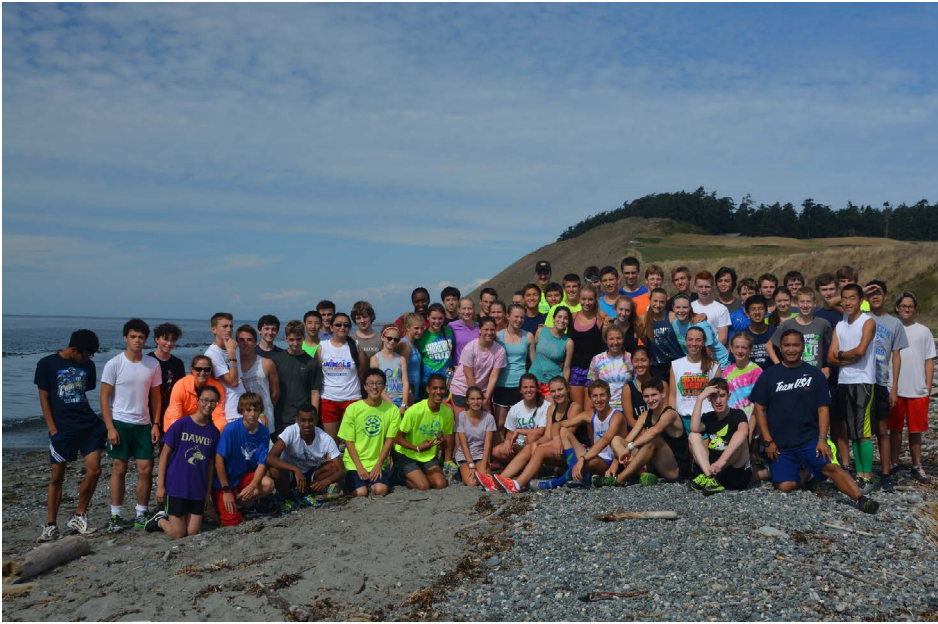
2014 Shorewood Cross Country Team on Whidbey Island.