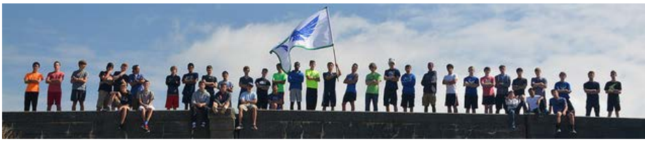
Photo at left: Cross Country Boys at Camp Casey over Labor Day weekend.