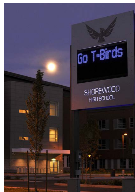
The recent Supermoon above Shorewood.

K-12 teachers across the Puget Sound area will be honored for educational excellence in the Symetra Heroes in the Classroom program during the 2014 NFL season. Teachers are recognized in front of their students and peers at surprise in-school presentations and they receive a $1,000 donation for classroom supplies. In addition, teachers receive tickets to a Seahawks home game and are acknowledged during an on-field presentation at CenturyLink Field. Over the last four years, 30 Shoreline teachers have been honored as Heroes in the Classroom. To nominate a Shoreline teacher as a Symetra Hero in the Classroom, visit SymetraHeroes.com/Seahawks .