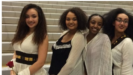
Above and below right: students on World Night, March 26, 2015.