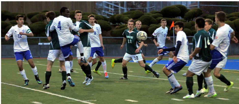
Boys Soccer vs. Shorecrest, April 22 nd . Shorewood won 1-0.