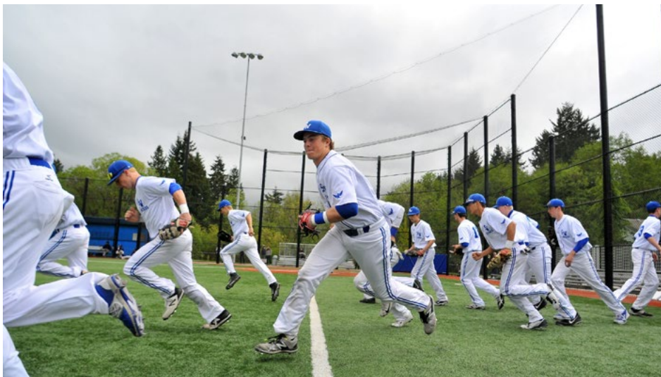
Shorewood Baseball ready to take on Meadowdale on April 21 st .