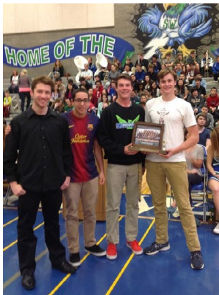
The Spring Sports Assembly on April 16th included some Winter Sports bling! On the left, the Boys Swim/ Dive Captains with the District Championship trophy. On the right, Gymnastics Captains with their District Championship Trophy.