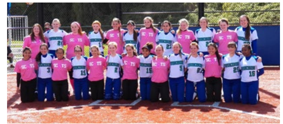
Fastpitch fun and competition April 11 th. Left, JV game vs. Bainbridge Island. Right, Varsity with rivals Shorecrest during Shorecrest's Pink Night Out.