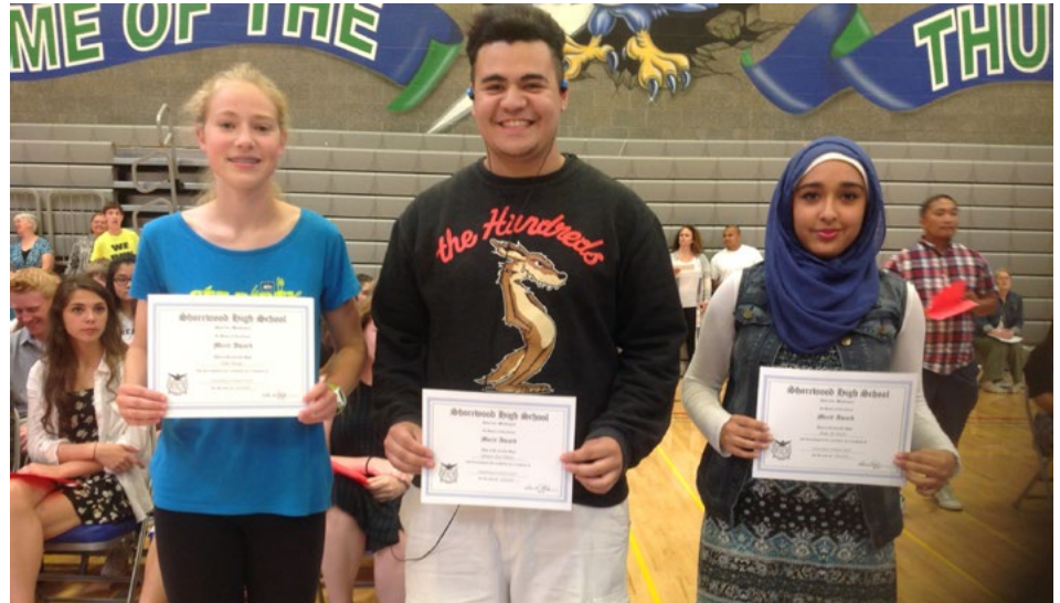
Outstanding Freshmen.