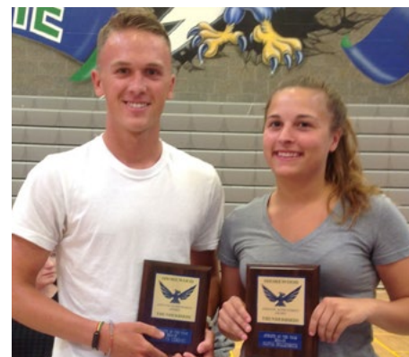
Athletes of the Year.