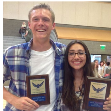
Scholar/ Athlete Award Winners.