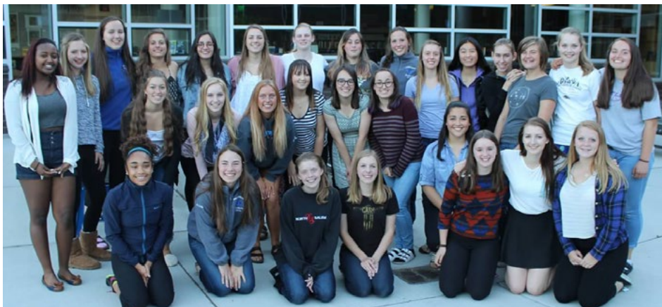
Shorewood Softball Teams at their June 4 th banquet.