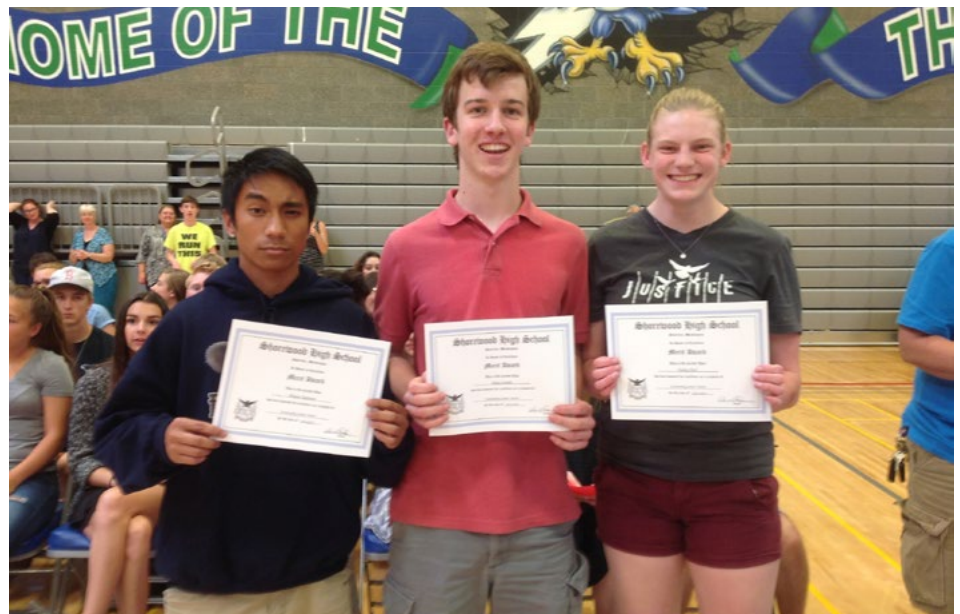
Outstanding Juniors.