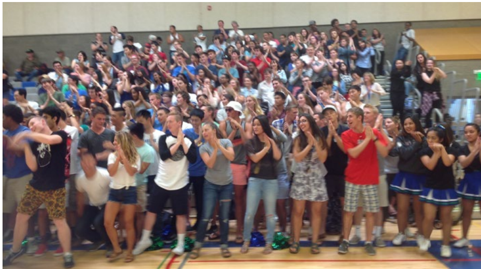
Blurry but fun: the Shorewood Class of 2015 doing the hand jive for perhaps the last time at the Yearbook / Awards Assembly Tuesday, June 9 th.