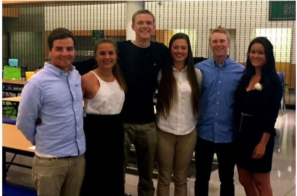
Several of our seniors after the Academic Awards June 2 nd.

This award recognizes academic success in the classroom. To be eligible, students must earn a minimum of 3.5 on a 4.0 scale.