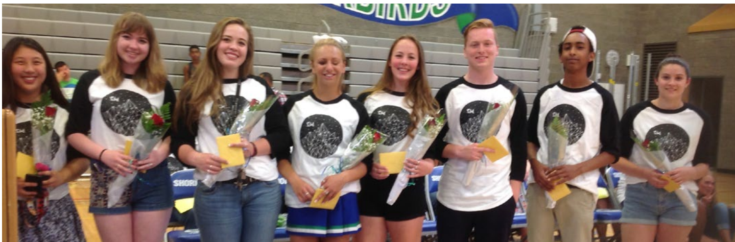
Seniors on the Yearbook Staff. At the Yearbook Assembly, the staff unveiled the 2015 yearbook theme: Different Angles.