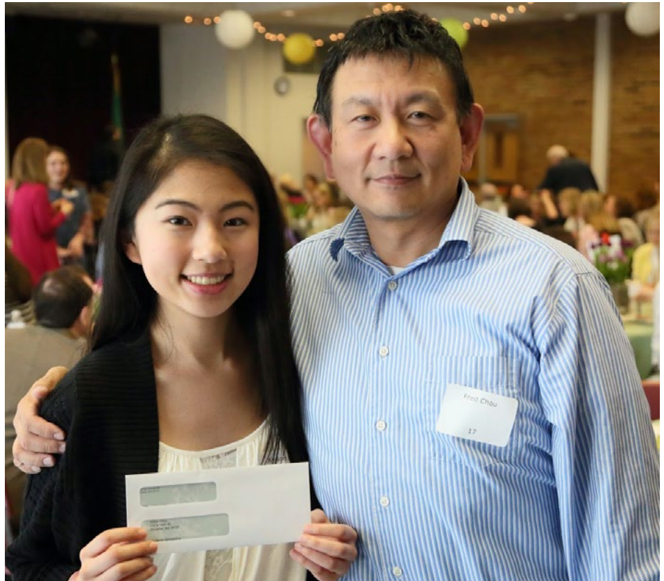
In March, the Shoreline Public Schools Foundation presented its third annual scholarship for Shorewood and Shorecrest seniors.