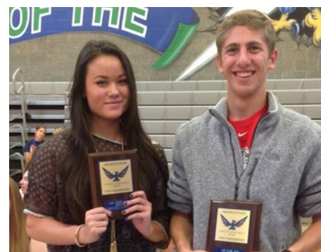
Cliff Gillies Award Winners.

The Shorewood PTSA publishes the Shorewood Signal electronically the first school day of the month September–June. Next regular issue September 9 th ; deadline August 21 st . Send submissions to shorewoodsignal@gmail.com . We publish school and PTSA news.