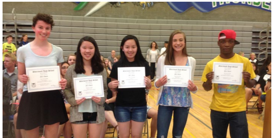
Outstanding Sophomores.