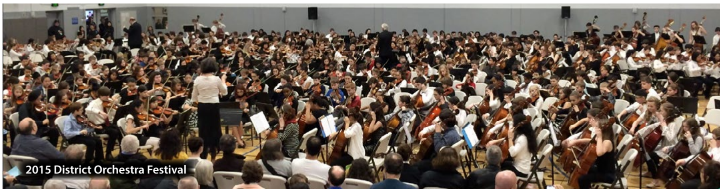
2015 District Orchestra Festival

Shorewood High School Drama proudly presents Joseph Kesselring's hilarious and deadly classic Arsenic and Old Lace . Beware the Brewster household, where nothing is as it seems! Two seemingly sweet and gentle sisters hide a sickening secret in their basement, while Teddy Roosevelt, Frankenstein, and Einstein haunt the old Brooklyn home. On April 2-4 and 9-11 at 7:30 p.m., come see if anyone is sane enough to survive! Tickets are $10 on Brown Paper Tickets, and $12 at the door. See www.swdrama.weebly.com .