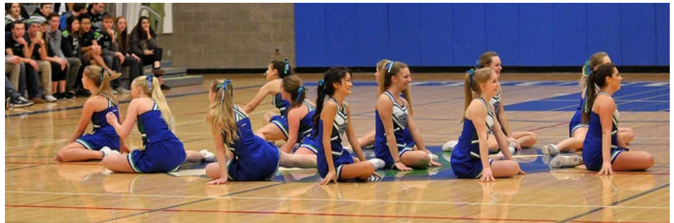
Drill Team Performance, basketball halftime January 30 th .