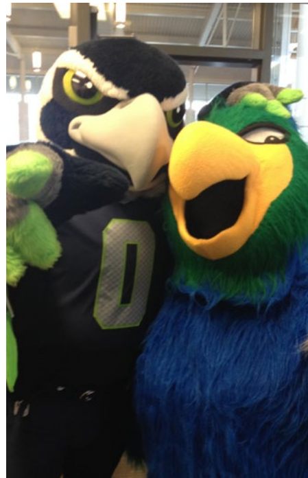
Seahawks mascot Blitz and our Shorewood T-Bird on the day of the Lip Dub. Both birds participated in the production; they appear at the end (which was really the beginning...).

Announcements on this page are selected to be pertinent for our Shorewood community. We cannot include all submissions we receive. For more community announcements that may be of interest to Shorewood families, see Shoreline Schools E-Fliers for summer camp announcements, information about local activities, and more, including a Free Dental Sealant Day for children & teens on March 14 th at Shoreline Community College.