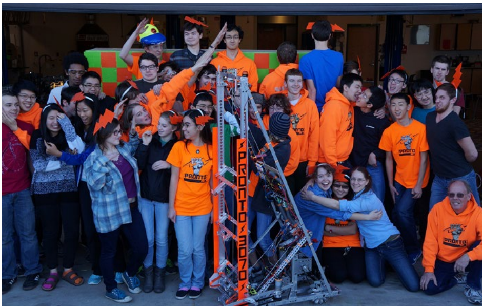
Team Pronto 2015.