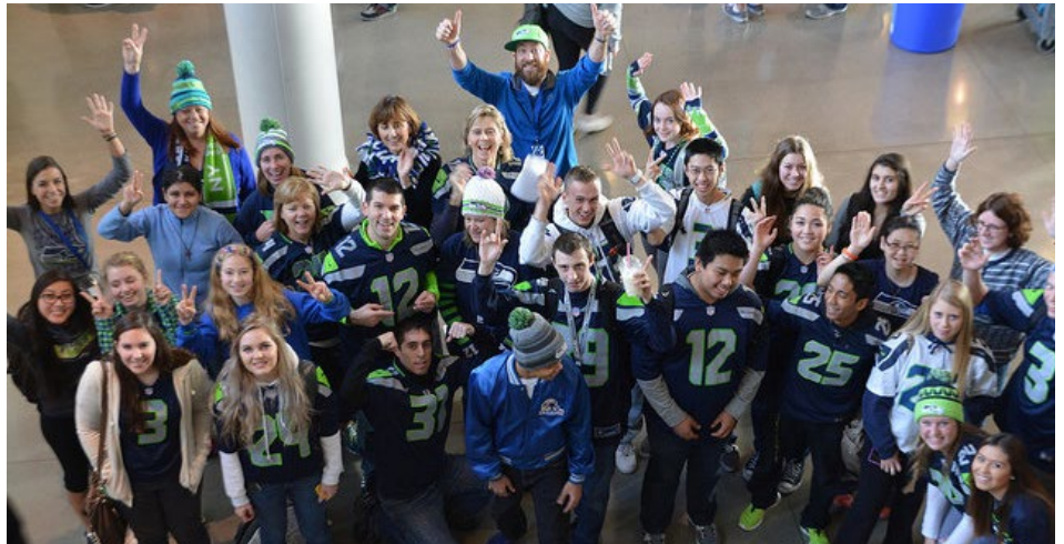
Blue Friday!

students figure out life After Shorewood, whether the goals involve college, vocational school, or a career.