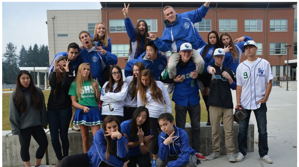
Spring Sports Captains. All spring sports begin on March 2 nd .