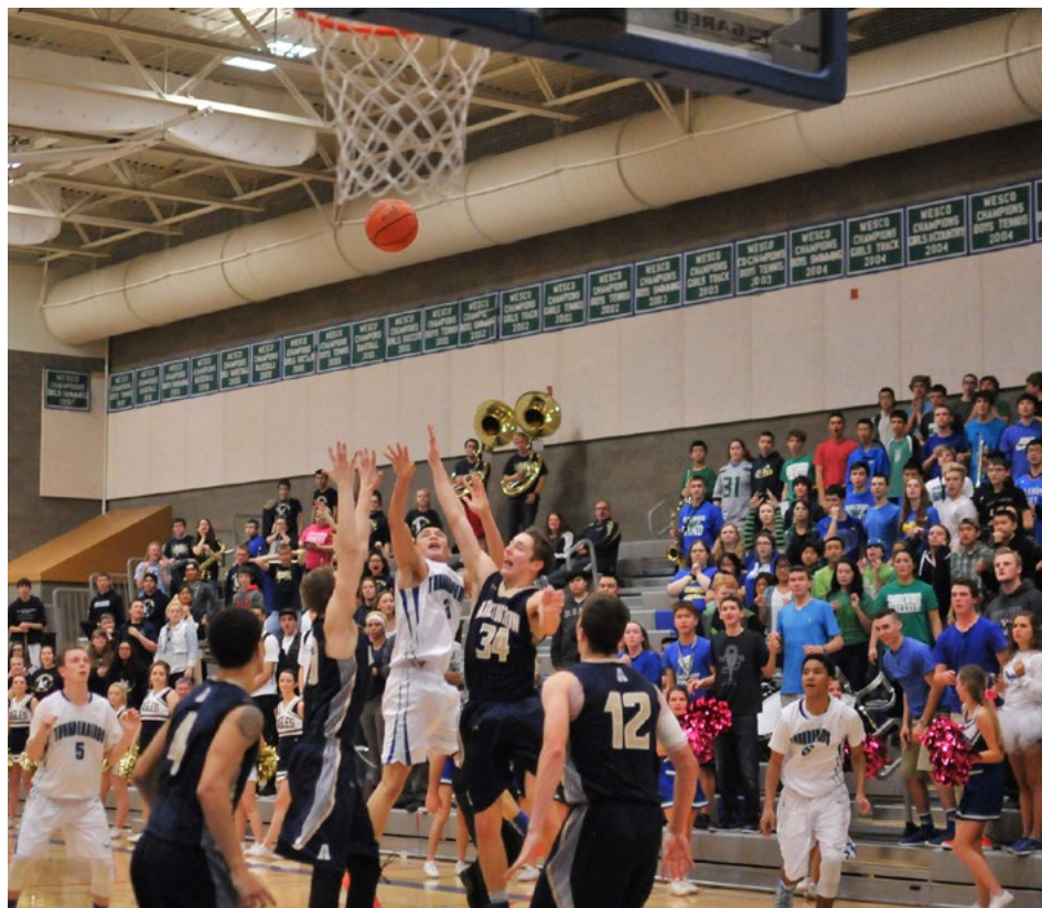
Boys Basketball February 18 th vs. Arlington.

Visit shorelinespecialneedspta.com or attend our upcoming meeting: Wednesday, March 25, 2015 Spartan Room. Social time 6:30 p.m.; meeting starts at 7:00 p.m. We will welcome a panel of district administrative staff to update about initiatives & projects, and answer questions about special education in Shoreline Schools.