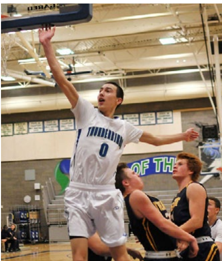
Basketball photo by Wayne Pridemore.

The High School Proficiency Exam (HSPE) is still the way for juniors and seniors to meet the state standard in reading and writing, required for graduation. Students will be assigned testing room locations the week of March 9 th . All tests will begin at 8:00 AM. Students should report directly to their assigned test locations. Absences from regularly scheduled classes will be excused. Students should bring #2 pencils, a snack and water bottle if desired.